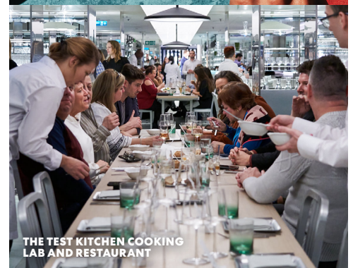
THE TEST KITCHEN COOKING LAB AND RESTAURANT