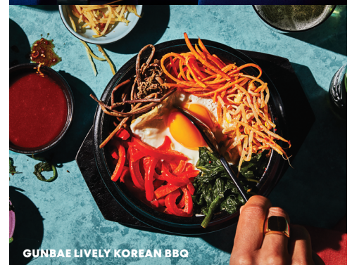
GUNBAE LIVELY KOREAN BBQ