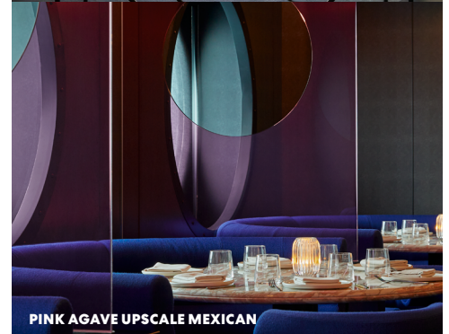
PINK AGAVE UPSCALE MEXICAN