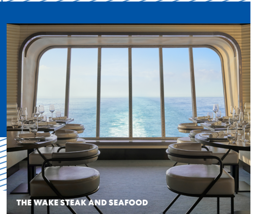
THE WAKE STEAK AND SEAFOOD